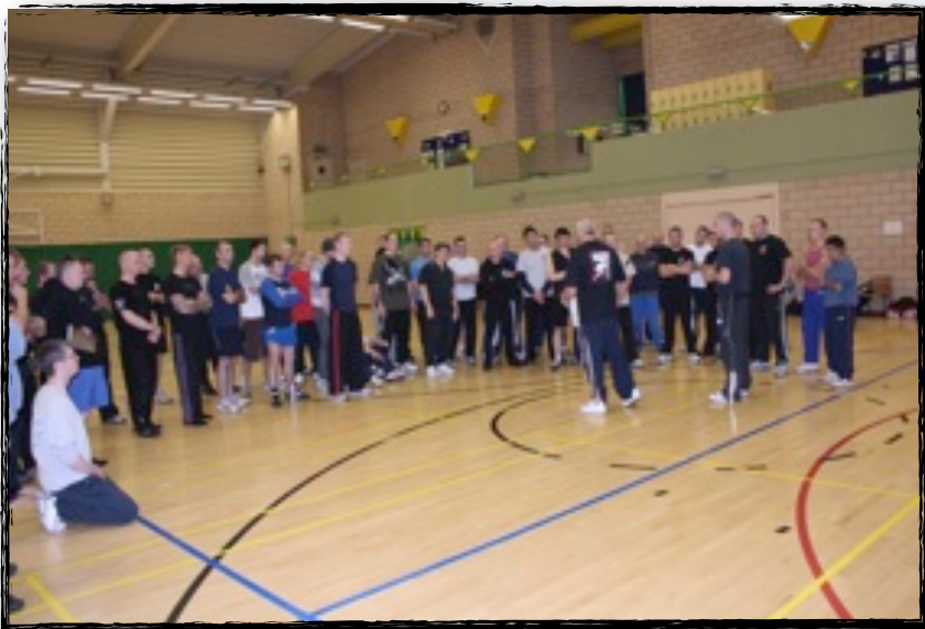
A BCA Residential Seminar in the U.K.

Under the umbrella of the Combat Group we now have the two domestic Associations - the British Combat Association , British Combat Karate Association with the World Combat Association providing all the benefits and support network that our domestic Instructors and clubs enjoy - www.thecombatgroup.com